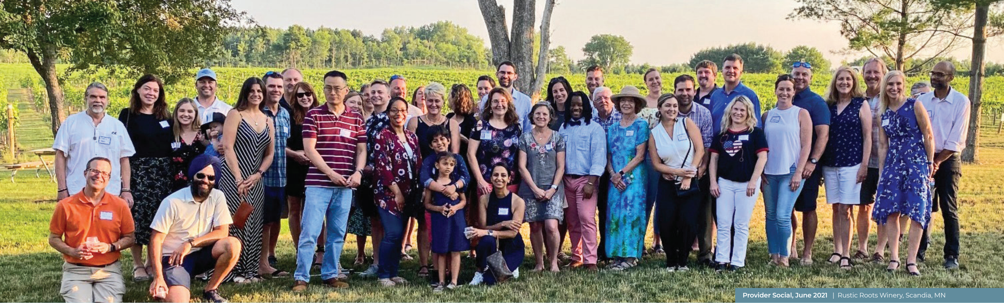
Provider Social, June 2021 | Rustic Roots Winery, Scandia, MN